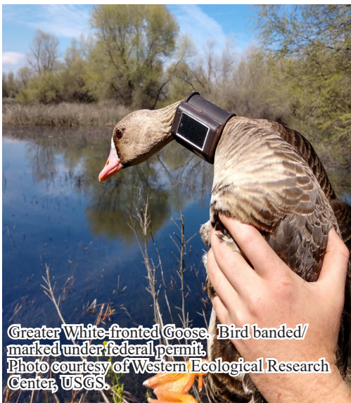
Greater White-fronted Goose. Bird banded/ marked under federal permit.

Bird with a satellite transmitter neck collar.