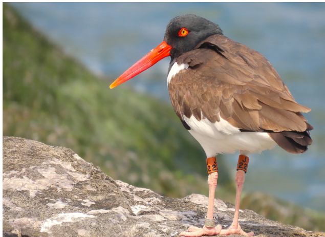
American Oystercatcher, Bird banded under federal permit.

Bird showing two plastic color leg bands with a triangle style code and a federal metal band.