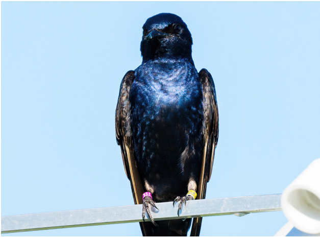
Purple Martin. Bird banded/marked under federal permit.

Bird with an anodized leg band and a painted federal metal band.