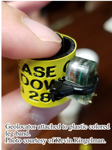
Geolocator attached to plastic colored leg band.

Transmitter attached to a plastic colored leg band.