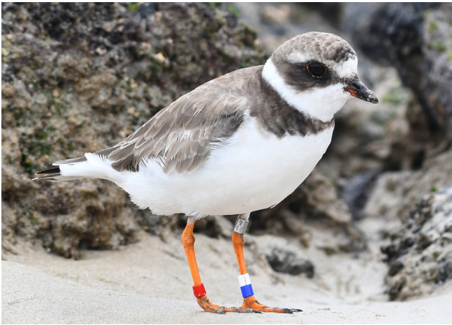
Semipalmated Plover. Bird banded under federal permit.

Bird with plastic colored leg bands and a federal metal band.