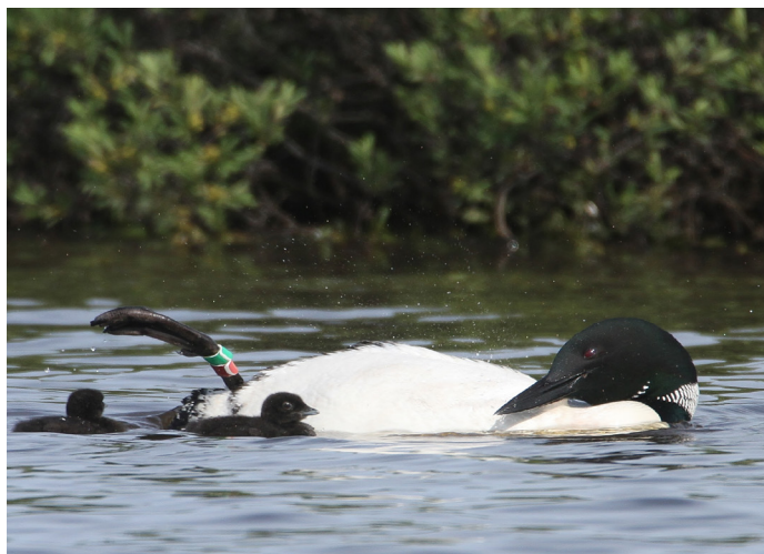
Common Loon. Bird banded under federal permit.

Bird showing a plastic leg bands with patterns and federal metal band.