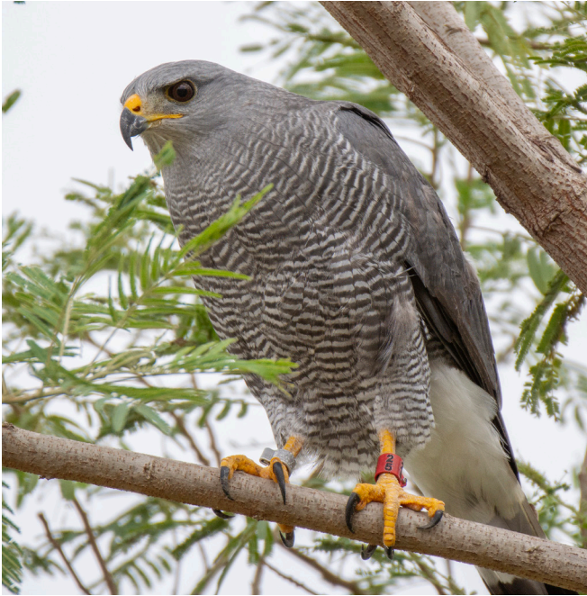
Gray Hawk. Bird banded under federal permit.

Bird showing an aluminum colored leg band and federal metal band.