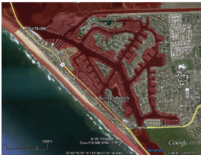
Inundation Map of Huntington Beach, California